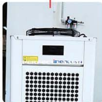
7P Water Chiller