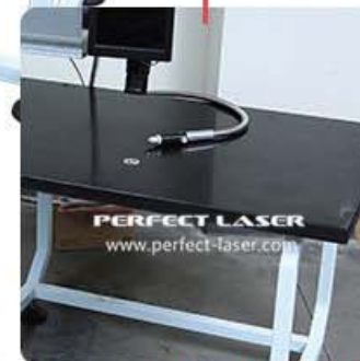
Marble Work Table